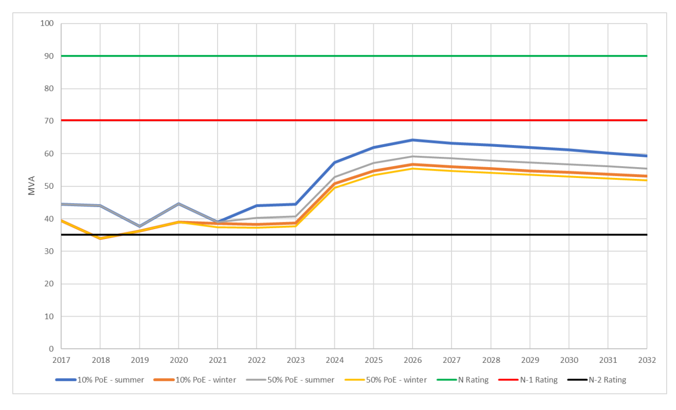
Figure 3-1: FW maximum demand forecast and ratings (MVA)

The FW maximum demand is forecast to be 44.4MVA for the summer of 2023 under 10% Probability of Exceedance ( PoE ). By 2032, it is forecast that maximum demand will be approximately 59.4MVA. The highest maximum demand over the 10-year planning horizon is forecast to be 64.3MVA for the summer of 2026.